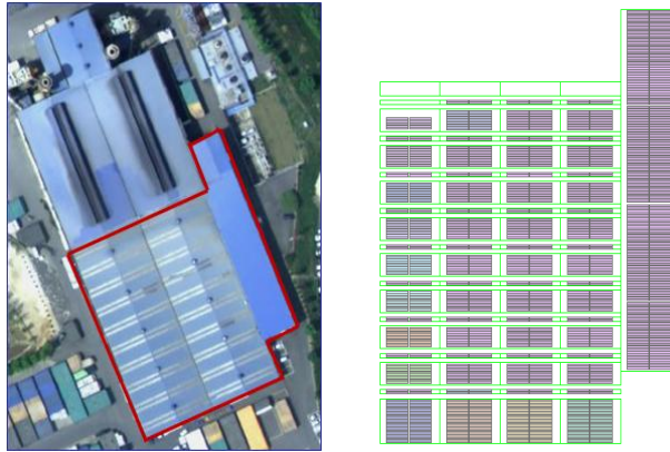
Figure 4. CASE and array design using PV3GIS

which constitutes 86.6% of the entire module slope area (2,805 m 2 ) of PV3GIS.