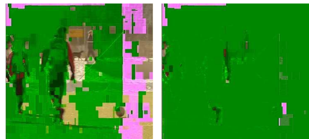
(a). R = 0.38 ; Q=0.438 (b). R=0.378 ; Q=0.031

the effects on the visual qualities for the protected bitstreams are significantly different.