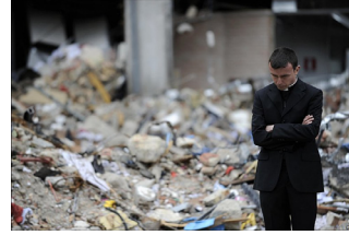
The original image

Take experiment to compare the original Canny method with the improved method combined Mean Shift smoothing and self adaptive thresholds selection, the result is obvious different: