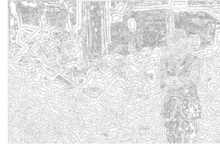
The result of using self adaptive Canny algorithm