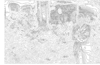
The result of Mean Shift smoothing plus self adaptive Canny algorithm, where