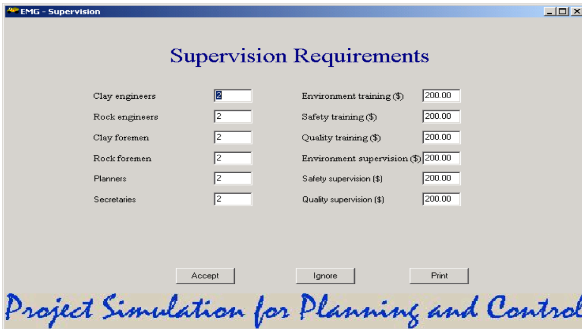
Figure 3. .Management, supervision and training decisions