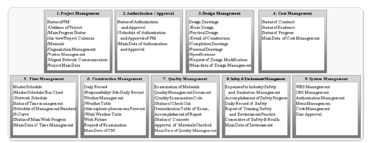
Table 3. Summary of Modules of both PMIS (Main Menu : 9, Sub Menu : 63)