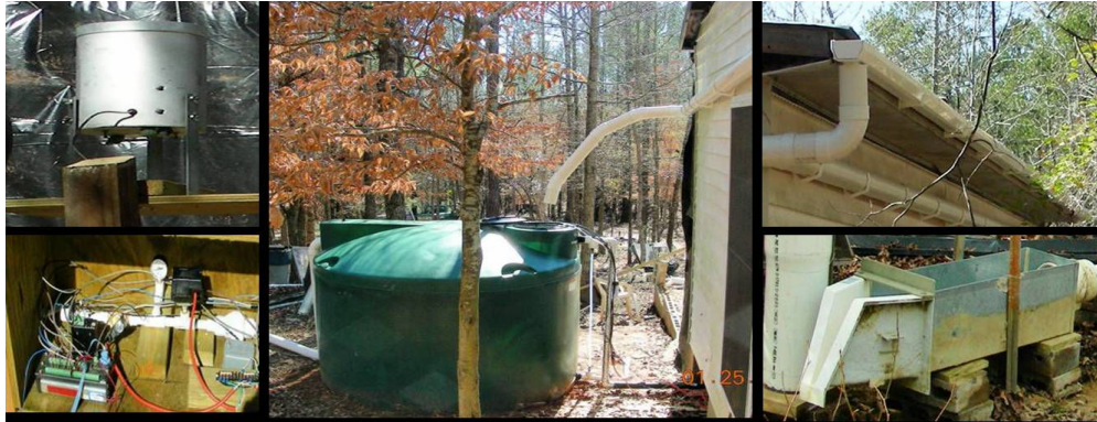
Figure 1. An RCR system installed at a rural single family house (rain gage, control system and datalogger, storage tank, HS flume and gutter).

system was completed in the spring of 2008 and system monitoring started in April, 2008(Case 3). Only one toilet was initially connected to the RCR system at the single family site during initial period of the study, from February 28 to September 28(Case 1). The second toilet was connected to the same RCR system on September 29, 2007(Case 2) (Table 1).