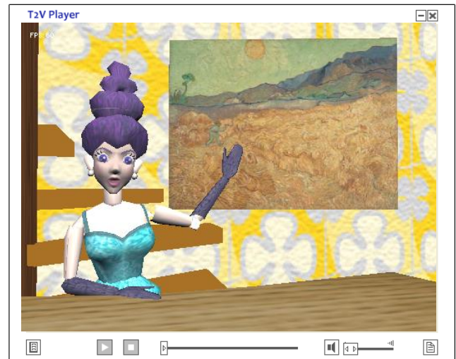
Fig. 3: T2V Player