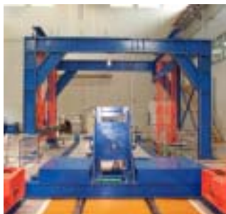
Safety Structure & Restraint