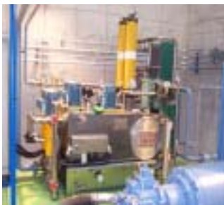
Bearing Lube Module