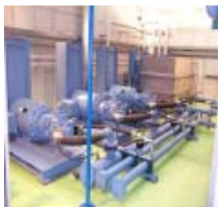
Hydraulic Oil System