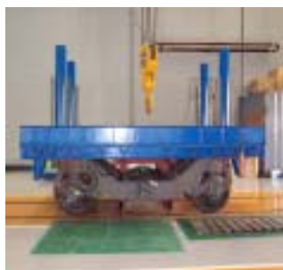
Interface Bed & Bogie