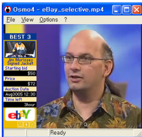
Figure 5. MPEG-4 contents by selective Authoring method

Figure 5 shows contents when selects priority order of event highest and selected priority order by image about next object, video, audio, rectangle order.