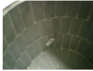
Fig. 3. one of two cracks in the lining plates, both appeared in cylinder-lining

Figure 4 shows flange and rotor. No cracks or damage could be noticed in the flange-lining and most surprisingly, no damage or cracks could be found at the Si 3 N 4 -bulk rotor-blades as well. The diameter of the blades has been measured and a diameter-loss of less than 2 mm has been determined. This is a surprisingly very good result and it should be pointed out, that the given total processing time of 4000 hours would refer e.g. to a 24-h-operation for a period of more than 5 months.