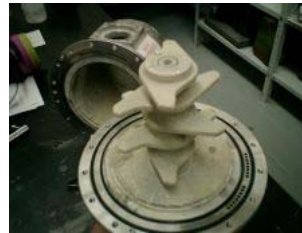
Fig. 4. no damage on the rotor-blades, wear surprisingly low, diameter loss less than 2 mm (after 4000 h !)

The YTZ grinding media did not show significant diameter-loss as well.