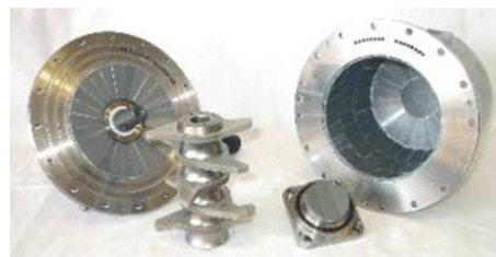
Fig. 1. grinding unit W01-21m-SiN (flange, rotor, vessel & blind-lid)

In the preliminary studies, 3 main parameters (time, rotor velocity and powder/ball ratio) have been investigated. The processing time has been varied between 30 and 150 minutes at different powder/ball weight ratios from 1:20 to 1:40.