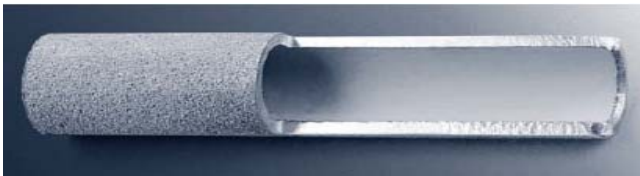
Fig. 3. Tube coated with porous metal membrane

In our works, other porous metals are felt/mesh, powder/mesh composition.