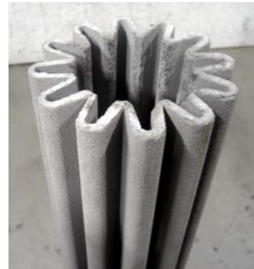
Fig. 1. cinquefoil cartridge

Porous metal material Lab has been established since twenty century 60s in NIN in which the key research focused in nickel, Monel and stainless steel porous filtration media. Civil application such as Ti porous material used for filtration in the medicine factory, juice purification, air distribution in oxygenator, supporter material in seawater desalt have been developed since 70s. In 1980s, to meet the requirements of oil industry and synthetic fiber industry, stainless steel, Ti, Ni porous materials and its element have been developed. In recent years, in accordance with the needs of energy and environmental protection fields such as clean coal technologies (CCTs), the irregular shape porous parts such as air cone and cinquefoil cartridge (Fig. 1) were developed.