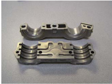
Fig. 1 MPIF 2006 Grande Prize winner, PM aluminum cam cap made by MPP (bottom) and a Toyota die casting cam cap (top).

not performance. In general, commercial PM aluminum materials offer mechanical properties that are better or equivalent to that of the cast aluminum materials. Lowering cost is one of the main reasons for substituting PM aluminum components for aluminum or zinc castings. One major advantage of PM aluminum over castings is the net shape capability, which significantly reduces the cost. For instance, cost of the PM double hump cam cap is more than 20% lower than that made by the casting, despite having lower raw material cost for castings. In addition, the PM technology allows small and intricate features to be produced, leading to the integrated and more complex oil tunnels in the PM cam cap than that of the die casting cam cap. Also, the PM technology produces a more uniform microstructure than the cast components.