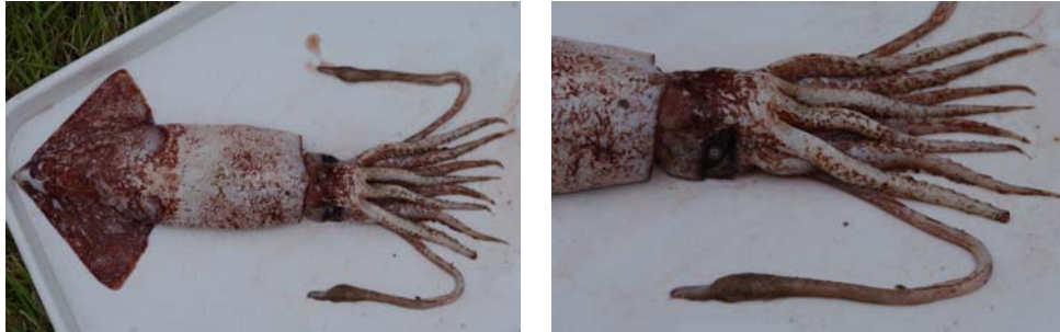
Fig. 1. Photograph of Berryteuthis magister (Berry,1913)

Materials : Berryteuthis magister (ML 324 mm) and Gonatopsis makko (ML 250mm) from the deep-sea of the East Sea, Korea, June, 2005.