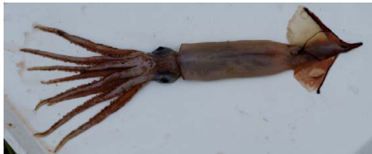
Fig. 2. Photograph of Gonatopsis makko Okutani & Nemoto, 1964

Description : The mantle of Berryteuthis magister is cylindrical with rather soft muscle. the body is typical teuthoid. This species exceeds 30cm ML. The antero-dorsal margin is bluntly triangular, while the ventral margin is shallowly concave with blunt lateral lobes. FL is 55–56% of ML and FW is 75–80% of ML. The head is cubic, with large eyes laterally. Arms are muscular with the formula III=II>I>IV. The tentacle is relatively strong, 120–160% of ML.