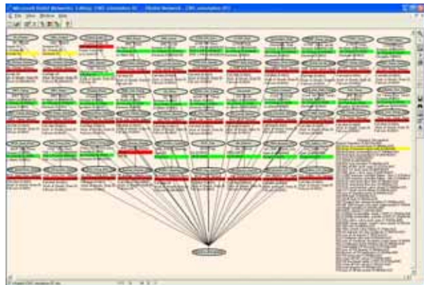
Figure 2. Bayesian network model for the situation assessment of the NPP operator

Figure 2 shows the Bayesian network model for the situation assessment of the NPP operator. From Figure 2, it can be seen that 31 indicators are considered as information sources, and the NPP operator consider 44 different plant states, the probability distribution of which represents the situation model of the NPP operator. In Figure 2, it is shown that the NPP operator makes the conclusion that the plant state is “Drop of several control rods,” from the observations that the reactor power is decreasing, generator output is decreasing, the full-withdrawal of control bank D, and the onset of the pressureizer backup heater.