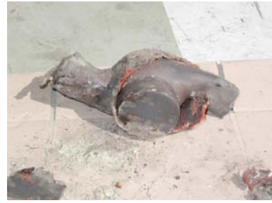
Figure 4. The depleted uranium shield after the thermal test.

It showed that the irradiator is sufficiently safe from the fire. Therefore, the thermal integrity of the irradiator can be maintained under a thermal condition of 800 °C.