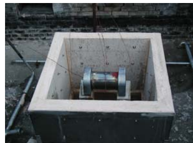
Figure 2. Irradiator in the test chamber.