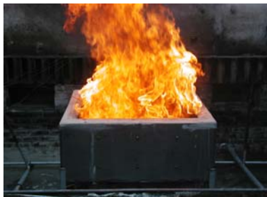
Figure 3. The shape of the engulfed flame.

Figure 3 shows the shape of the fully engulfed flame. The average flame temperature measured in the thermal test was 807 °C. Therefore, the thermal condition, which is prescribed in the regulatory guide-lines, was satisfied.