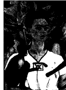
Monkey & Self Portrait