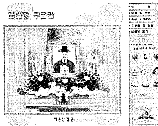
Figure1. Prototype of a general cyber cemetery on the web

The interfaces of exiting Cyber Cemeteries usually look like figure 1. These Cyber Cemeteries follow a figure of traditional Korean funeral. Users record simple information of a dead person and send a message to the dead person. However, the market of Cyber Cemeteries has become depressed. The writer thinks it is because these Cyber Cemeteries didn't utilize the merit of the digital technology well.