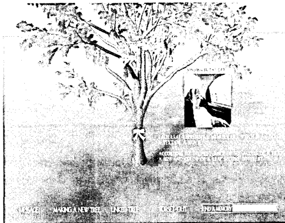
Figure 2. Interface of the personal memory tree

In Soul Forest , users can feel themselves going to a fantastic, mysterious world and relax in the virtual forest. Soul Forest is the web environment in which people can perform a cemetery to build the dead persons memory and set up an organic monument to the memory of the person by making a virtual tree. Users can store and recall the memories of other users as well as the deceased.