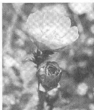
Amur adonis flower

The rate of plant differentiation was higher in media with growth regulation substances than in control, and was the highest in 1/2 MS medium with NAA 0.5 mg, BA 0.1 mg and kinetin 0.1 mg per litter of the media with growth regulation substances, as were 69%, 62% and 47% in callus, shoot and root formation rate, respectively.