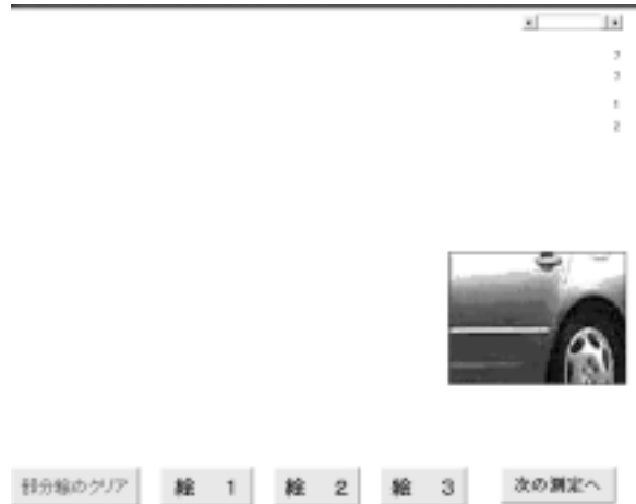
Fig. 4 Presumption of the finished each model based on five pieces

The subject watches five pieces of the square pole, the cone, and the car respectively. He/She presupposes of the finished each model from five pieces shown in Fig. 4.