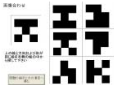
Fig.3 Find a similar pattern with a standard pattern in six patterns.

Six kinds of random patterns are different in the form, the size, and the direction respectively. The subject can find a similar pattern with a standard pattern in six patterns shown in Fig. 3.