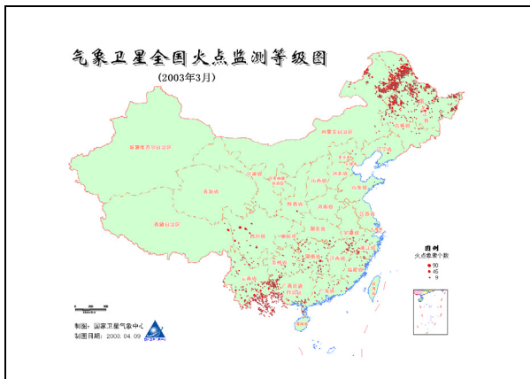
Fig.3. Hot Spot Class Map of Whole Country

We can also provide the fire-spot class map, which is necessary and important for fire prevention offices to make decision. For instance, Figure 3 shows the fire-spot class distribution in the range of the whole country. Based on the number of pixel covered, 1-5, 5-25 and 25-50 pixels, fire-spots were divided into three classes. Each class was presented by point of different diameter, the shorter the diameter is the fewer pixels one fire-spot includes, and therefore, we can know the location and distribution of hot spots.