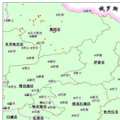
Fig.1. Local Hot Spot Distribution Map

Fire-spot data can be accessed from the database of server by telnet, then geocoded with the geographic information, so we can easily identify the fire-spot location from the obtained fire-spot distribution map (Figure 1). We can provide better service for forest fire prevention offices. At present, all these work can be finished automatically, and Internet can issue the products in real time. The fire-spot information was obtained and mapped on the administration map, as shown in Figure 1, the red spot in the map represent the location of fire-spots.