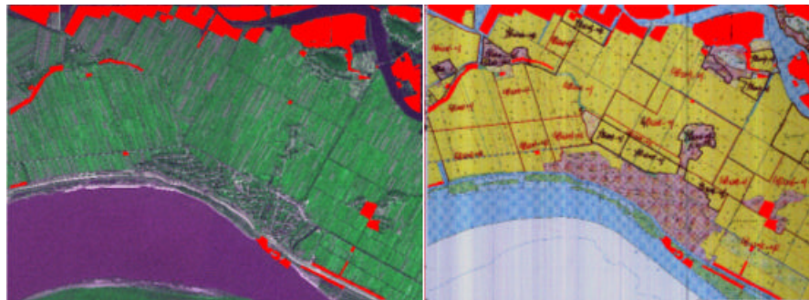
Fig.3 Object-oriented change information automatic extracting (red region) and updating land use map (right)