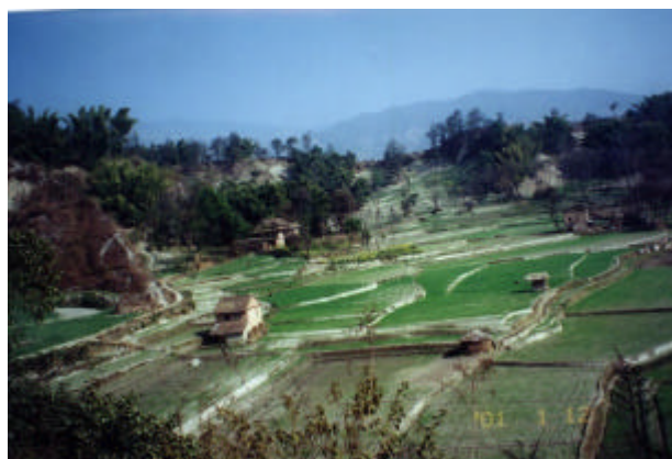
Fig. 1 Proposed landfill site at Taikabu of Bhaktapur

With respect to the infrastructure and other relevant criteria sensitive to waste disposal, Taikabu area (Fig. 1) was found to be the most appropriate site for landfill site development. It is a bowl-shaped natural depression nearly with 500 meters diameters and bound by vertical walls, composed of sandy to silty sediments on the top and silty to clayey towards bottom from three sides. It is located at about 5 km east of Bhaktapur municipality office and about 1.5 km southwest in the vicinity of the Taikabu village. The area has only one outlet towards southeast direction with Hanumante River. Auger drilling to a depth of 5.25 m at the valley-floor revealed an increase of clay content with high CEC values towards depth. However, the area is a cultivated land, there are only a few small houses around and a motorable road has already reached up to the rim of the depression. The depression has a sufficient capacity to develop the sanitary landfill site and manage the urban waste of the whole Kathmandu Valley for at least 50 years with adequate space for establishing composting and recycling facilities.