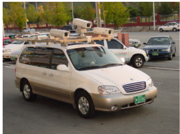
Fig.1 The outside of 4S-Van

4S-Van is shown in figure 1. The GPS combined with INS generates data to produce accurate position and orientation information by Carrier Differential GPS(CDGPS) and loosely coupled methods. CCD cameras acquire stereo images of objects. Three-dimensional(3-D) coordinates of various objects included in the stereo images are calculated by using GPS/INS data and internal and external parameters of CCD camera. The IPC stores images from CCD camera and the ESD generates a pulse to synchronize GPS, INS, and image data.