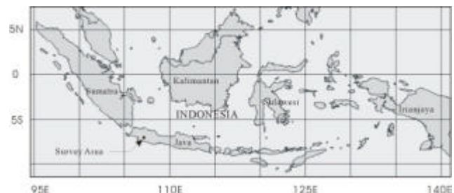
Fig. 1. Location map of study area.

The purpose of this preliminary study is the applied to geology using the Landsat TM satellite image of the study area. With this, slopes, aspect, curvature, hill shade of topography were calculated from the digital topographic map (1:25,000 scale) (Fig. 2). Lineament, lineament density, and NDVI were extracted the Landsat TM satellite image (Fig. 3).