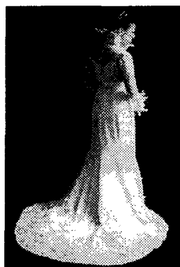
<Design III >