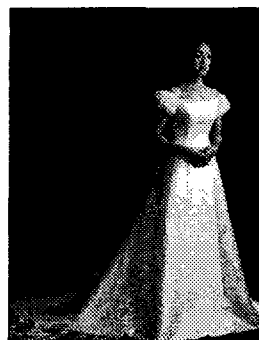
<Design II >