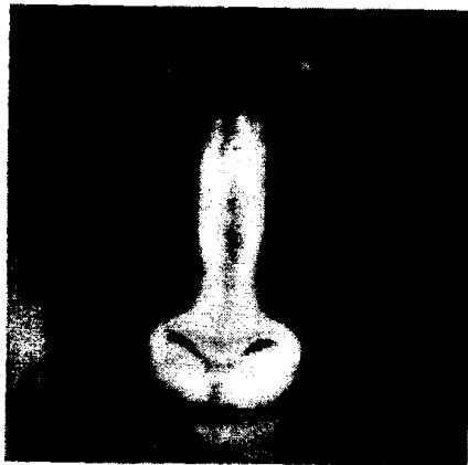
Fig. 2. The standard algorithm (degree = 1, scale = 0.97, iteration = 10).