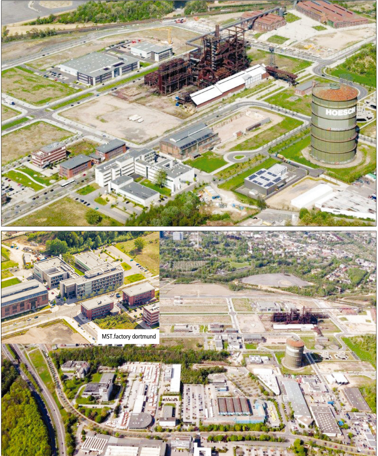
Fig. 4. Center for Production Technology and MST.factory