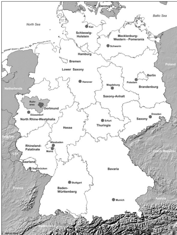
Fig. 1. Geographic Location of Dortmund in Germany