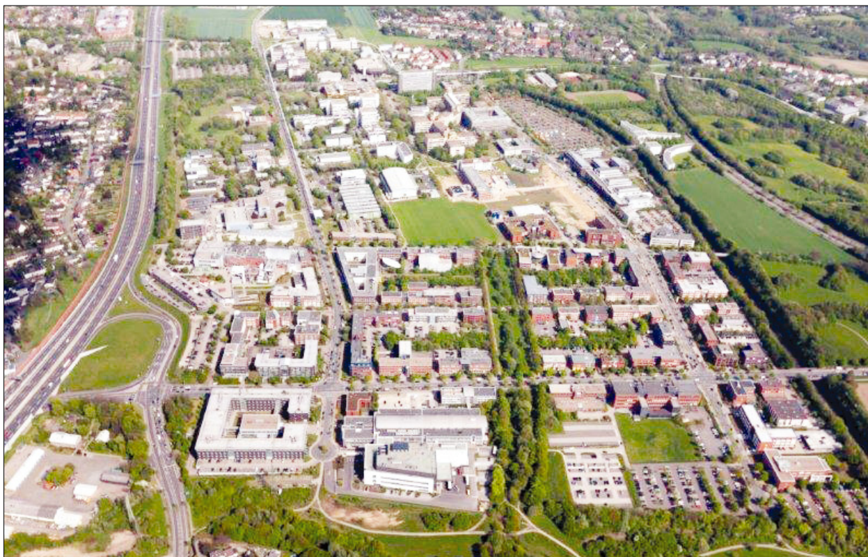
Fig. 2. Dortmund Campus with TZDO and Park

The adjacent area of 40 ha next to the joint campus of the TU Dortmund University and the TZDO for the TechnologieParkDortmund was planned already in the zoning map in 1985 when the TZDO was founded. First construction activities started here in 1988 after the second construction section of the TZDO was completed in 1987. The park offers young enterprises which have hatched out of the incubator TechnologieZentrumDortmund space for the construction of own premises. It is likewise an excellent location for enterprises which seek contact to scientific institutions but have no need for the kind of support provided in the TechnologieZentrumDortmund. The TechnologieParkDortmund has grown fast and accommodates today more than 250 companies with over 8,000 employees. TZDO and TPDO together have created more than 13,000 employment oppor-